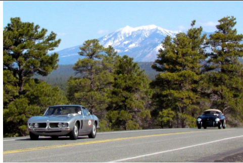
Copperstate 1000 Rally – Report and Photos (2012)