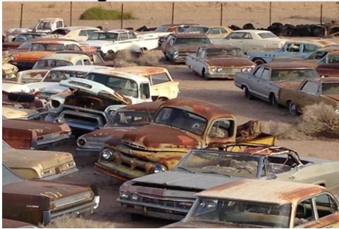
Field of Dreams? – Lot of 550 Vintage Automobiles