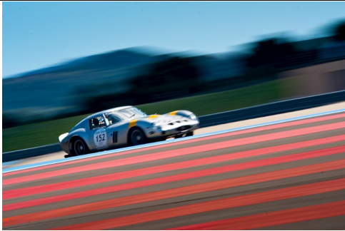
Tour Auto Rally – Report and Photos (2012)