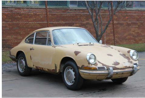
One Owner, Plenty of Issues – 1968 Porsche 912