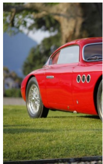
Concorso Villa d'