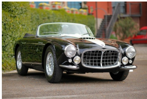
Concorso Villa d'Este – Report and Photos (2010)