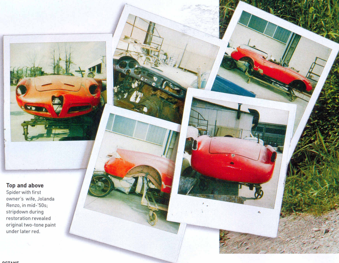
Top and above Spider with first owner's wife, Jolanda Renzo, in mid-'50s; stripdown during restoration revealed original two-tone paint under later red.