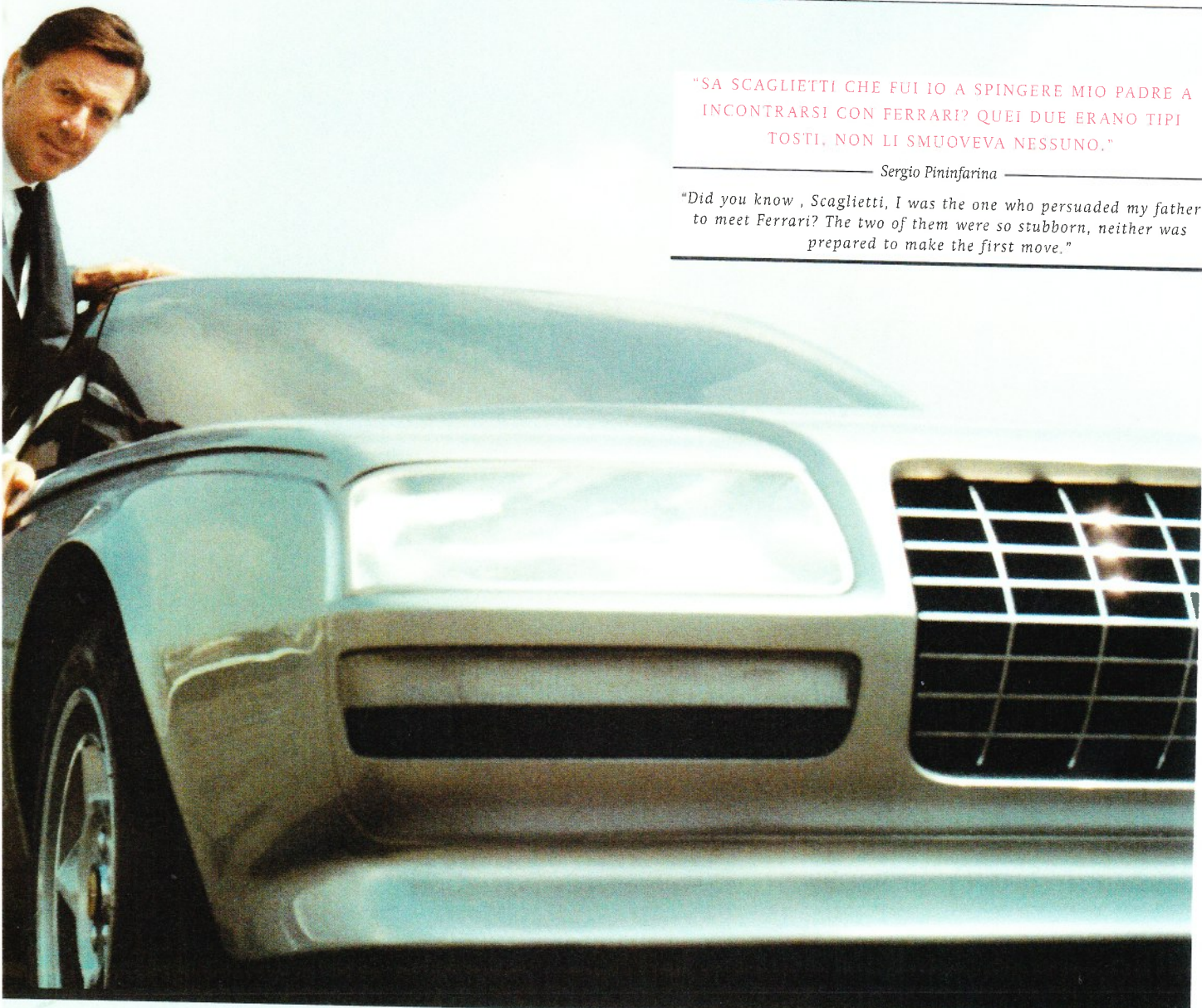
Pininfarina di fianco alla quattroporte Pinin, rimasta allo stato di prototipo. Pininfarina beside the 4-door Pinin that never got beyond the prototype stage.

"Did you know, Scaglietti, I was the one who persuaded my father to meet Ferrari? The two of them were so stubborn, neither was prepared to make the first move."