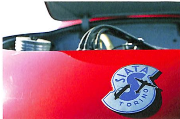
Left and far left The badge suggests an industrial interest in cars and aircraft, though that's not quite the real story; 742cc four-cylinder engine revs to a screaming 7000rpm.

'The tiny engine sounds inconceivably potent given that it's packing maybe 40bhp'