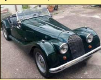
1968 MORGAN 4/4 ( 2 SEATER ) - REBUILT TO A HIGH STANDARD