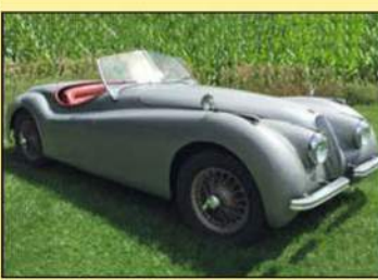
JAGUAR XK120 ROADSTER LEFT HAND