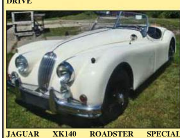
EQUIPMENT MODEL, LEFT HAND DRIVE