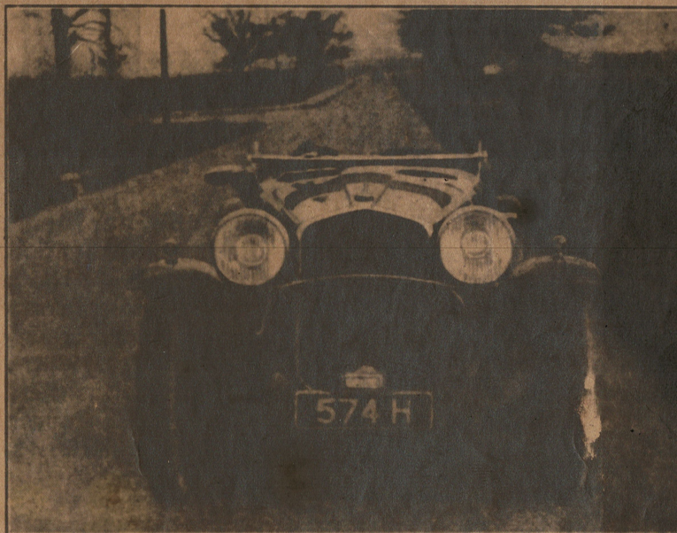
[Motor Sport Photograph]

It was not possible to try the car on a complete outer circuit of Brooklands, owing to the collapse of the bridge over the Wey, but the speedometer was checked. Another difficulty in making a complete speed chart was that the speedometer reading started at 12 m.p.h. The figures recorded confirmed one's impression of exceptional acceleration up to 60 m.p.h. Comfortable maximum speeds in second and third gears were 45 and 60