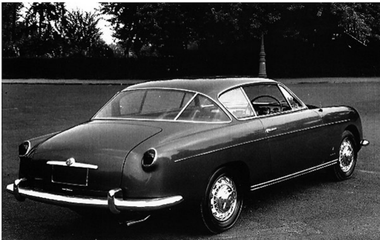
Ghia 1900 L – what a view and RHD too

The Mostly 1900 Irregular Newsletter 302 Brown Thrush Rd Savannah GA 31419-6091