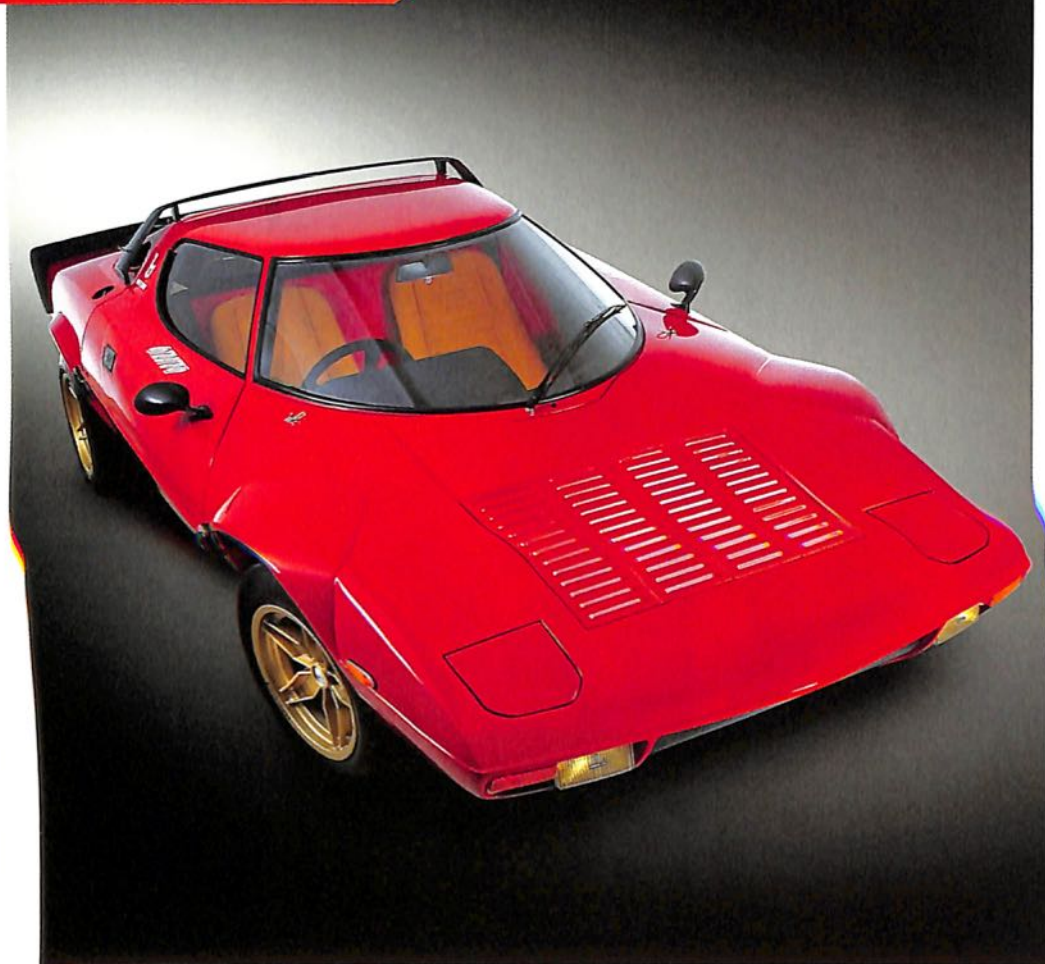
Clockwise from left Go for the Stradale look (like this one from Hawk) or full-on rally livery (Lister-Bell in this case); New Stratos remains a Ferrari 430-powered one-off.