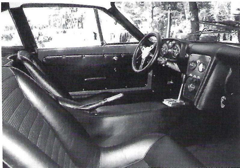
Interior trim has been restored in leather and vinyl as original. Wood dash was replaced. Transmission is a VW splitcase with Hewland parts.

Schaub: It is fiberglass. The chassis number says already that it has to be fiberglass. The aluminum cars were prototypes and did not