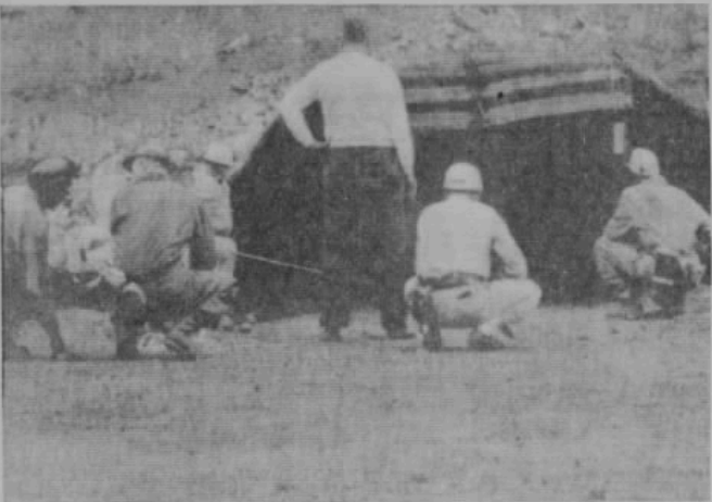
MINE DISASTER — A rescue team from the Hanna coal company in Berhonia, Ohio, awaits the results of a gas content test at an area of the mine where the Morgan Mine which was hit with fire Wednesday trapping three

Published by Valley Morning Star 2015 N. 1st St. Harlingen, Texas 79125