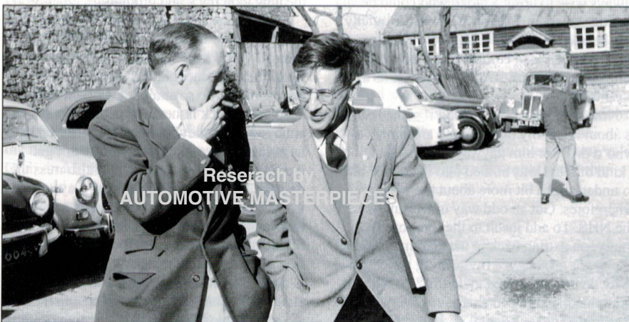
Reserach by AUTOMOTIVE MASTERPIECES