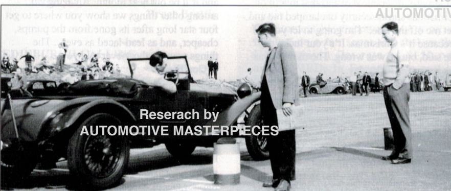
Reserach by AUTOMOTIVE MASTERPIECES