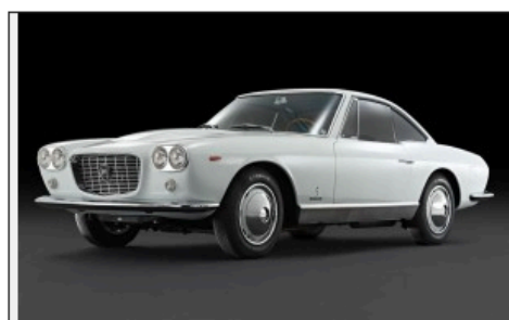
1963 Lancia Flaminia 3C 2.8 Speciale