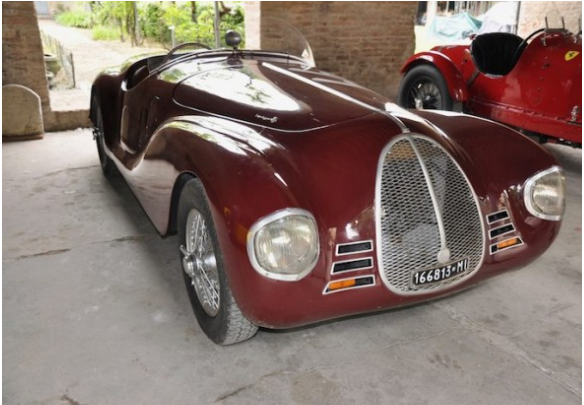
Auto Avio Costruzioni (AAC) Type 815, the first car Enzo Ferrari built after leaving Alfa Romeo. Enzo Ferrari built two AAC and this particular car was raced in the 1940 Mille Miglia by racing legend Alberto Ascari; only surviving AAC