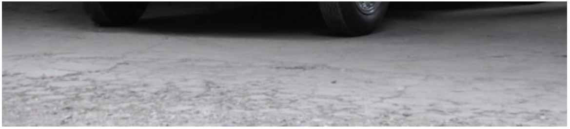
Ferrari 500 Mondial Pinin Farina Spyder