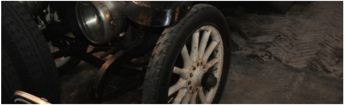
This 7 liter Fiat Chiribiri reportedly broke the world speed record for the timed kilometer from a flying start in 1912.