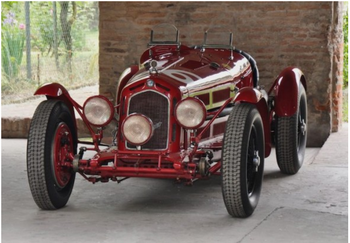
Alfa Romeo 8C 2300 that was owned and raced by Tazio Nuvolari to victory at the 1933 Targa Florio and Monza Grand Prix