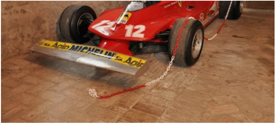
Ex-Gilles Villeneuve Ferrari 312 T4