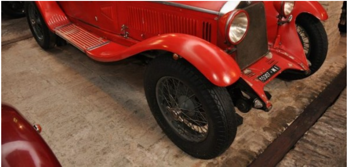
Alfa Romeo 6C 1750 GS Zagato

In addition to the highlighted cars, the pre-war stable includes ex-military Alfa Romeo 6C 2500 Torpedo Militare; Alfa Romeo RL SS Corto Torpedo; Salmson racing car; 1894 Velo Benz (first plus several Bugatti, Fiat, Lancia and other Alfas.