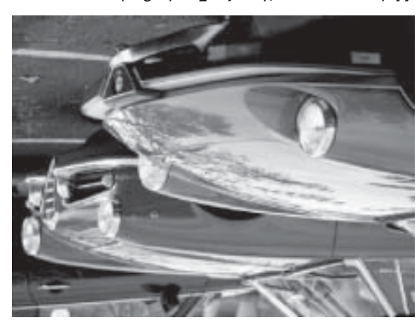
Make your reservations for Eureka Springs -- rooms are going fast!

i Saluti Alfa Romeo Owners of St Louis 6089 S Lakeshore Dr Hillsboro M O 63050