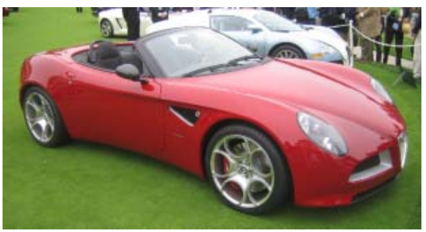
The first time ever seen in public, the open-top variant of the 8C Competizion, claimed its share of ooos and ahhs as part of the concept car circle. They didn't exactly let us flip up the hood; but ,allegedly, the same 4.2L V8 of the couple version lurks under there. Will she or won't she be produced? For us? Ah...

There's something really wrong about a jumbotron at the Concours d'Elegance. But I guess if you haven't been there when the 18th green was a hug at first sight, a bow and flourish attempt to prep you for the initial jaw-dropping glimpse of wave after wave of gorgeous machinery coming at you from the fairway, then maybe it wouldn't seem so, well, unbecoming.