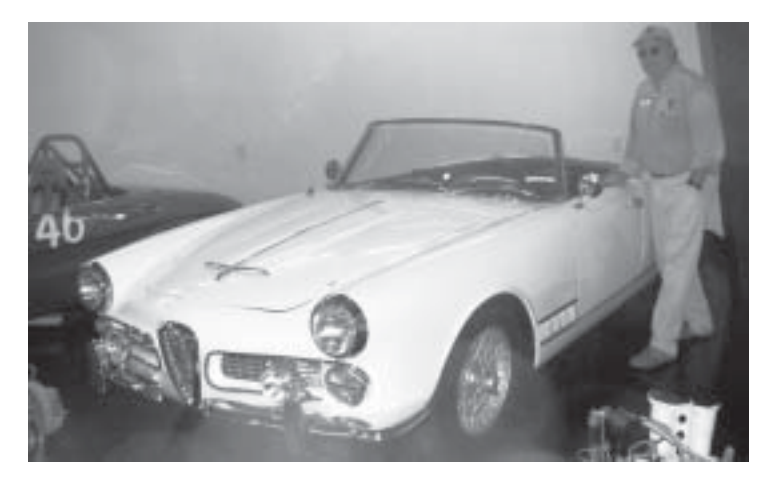
Other Alfas Dr Whitlock has include: One regular road Duetto, red, with oversized tires. One Alfa Giulia SS (like Coldewe's) red with gold wheels.

engine) which he still has in concours shape. (I told him to call me first if he sells it). An "Imported Cars" reference I have says these cost $3784 new and weighed 1830 lbs. with a top speed of 99 mph. Economical 30mpg and zero to sixty in about 10 secs, 65 hp and 8:1 compression ratio. Two barrel carbs, solid valve lifters. Length: 152 inches, width: 62 inches. Described as "strikingly flamboyant" by past authors, I agree 100%. Only 17,096 Spiders were made.