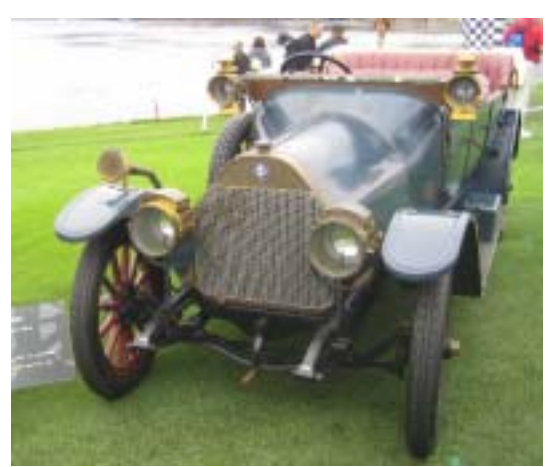
Sole surviving 1910 24hp ALFA (not yet Romeo) Torpedo last flew from Italy to Pebble Beach in 1985 and wound up towing a Tipo 159 Alfetta back to its transporter when it ran out of fuel.