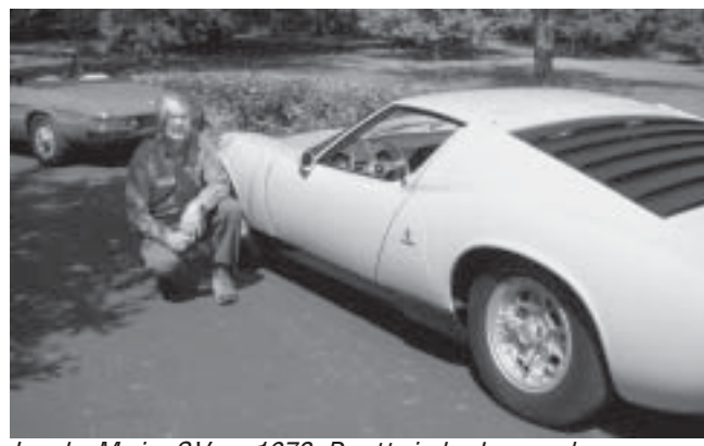
Lambo Muira SV ca. 1972. Duetto in background.