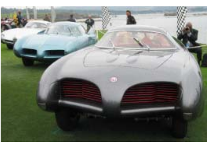
The first Alfa, first Alfa Romeo and the wonderfully weird and amazing Bertone-bodied B.A.T.s (Berlina Aerodynamica Technica) were among the 60 some Alfas strutting their stuff at the 55th running - sitting? - of the Concours d'Elegance at Pebble Beach. Several of the racers circuited Laguna Seca in anger the day before.