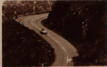
The rugged, towering cliffs dwarf Ila Anderson's Porsche coming through blind S bends.