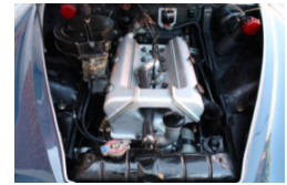
1953 Alfa Romeo 1900 $375,000