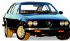
1975-80 Alfa Romeo Alfetta GT/Sprint