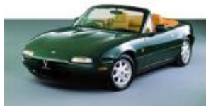
Top 25 Roadsters