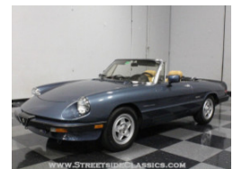
1986 Alfa Romeo Veloce $17,995