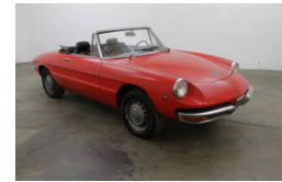
1970 Alfa Romeo 1750 $11,750