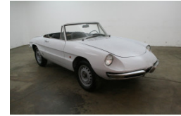
1967 Alfa Romeo Duetto $10,750