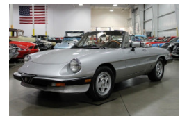
1985 Alfa Romeo Spider $13,900