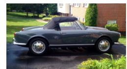
1962 Alfa Romeo Giulietta $65,000