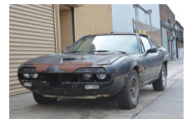
1972 Alfa Romeo Montreal $21,500