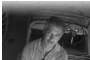
The Only Color That'll Do