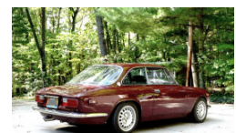
1974 Alfa Romeo GTV 2000 $37,500