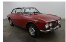
1973 Alfa Romeo GTV $12,750