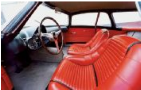
B.A.T 5 Interior

The Abarth's avant-garde design was the work of Bertone's new chief stylist, Franco Scaglione. At 35, Scaglione was three years Nuccio's junior, hailed from Florence, and had studied engineering. The war interrupted Scaglione's education, but that didn't stop him from entering the automotive industry as a designer. Quiet and reserved, beneath that placid exterior was a design mind unlike any other--ask Italy's stylists who are the greatest "artists" of their craft, and Scaglione is usually one of the first names mentioned.