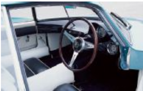
B.A.T 7 Interior

Up front, the nose was lower, and the protrusions where the headlights would normally be found stuck out even further. The headlights themselves were located next to the nose and swiveled down when in use. Even Fiat's experimental one-off wind-tunnel-derived Turbine car, which also made its debut at the show, seemed tame in comparison. Turin 1955 brought the introduction of the B.A.T. 9, the third and final element of the project to make it to metal. Based on a 1900 C Super Sprint chassis, this time Scaglione's exuberance for design seemed more restrained. The rear split window remained, but now the fins seemed to draw directly from Fiat's Turbine car of the previous year. The rear wheels were exposed for the first time, and the greenhouse was more conventional. Up front, the lights were traditional, inset behind clear covers in the front wings. The general design, proportions, and styling cues of the B.A.T. 9 were seen on a number of other Bertone design projects throughout the balance of the 1950s; these included a one-off Abarth 215 A coupe, Bertone's limited-production Alfa Romeo Sprint Speciale, and a one-off Maserati 3500 GT in 1959.