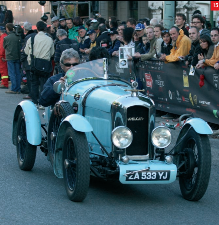
15 Berzero (I) Berzero (I) AMILCAR CGSS (1927)