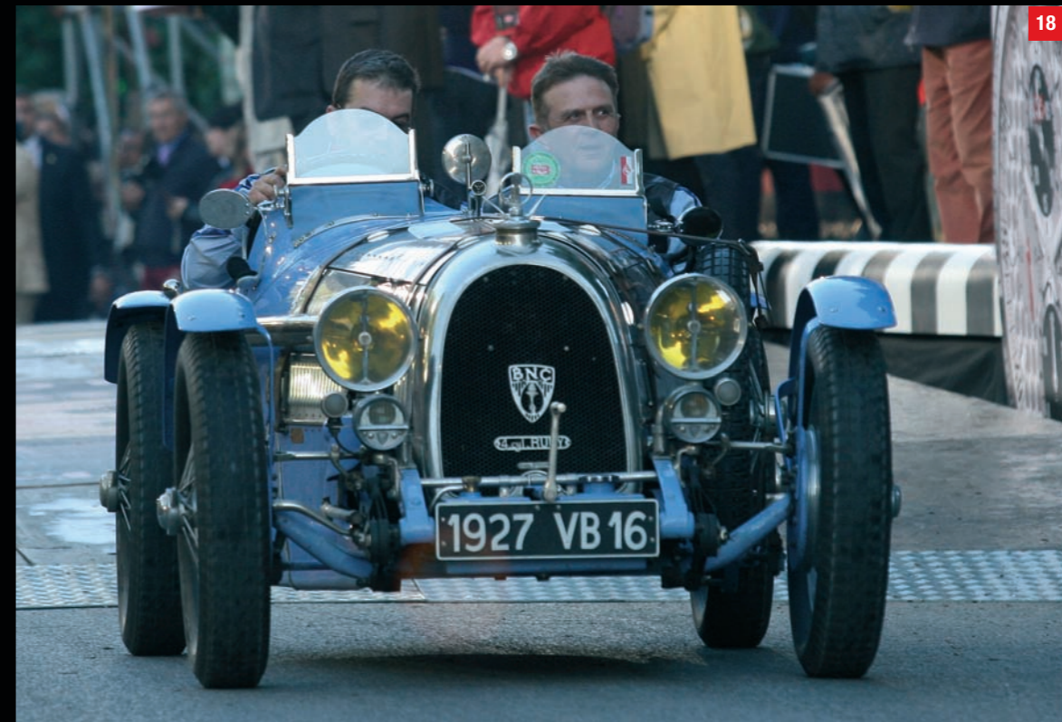
18 Roma (I) Ider (I) BNC 527 1100 Grand Sport Monza (1927)