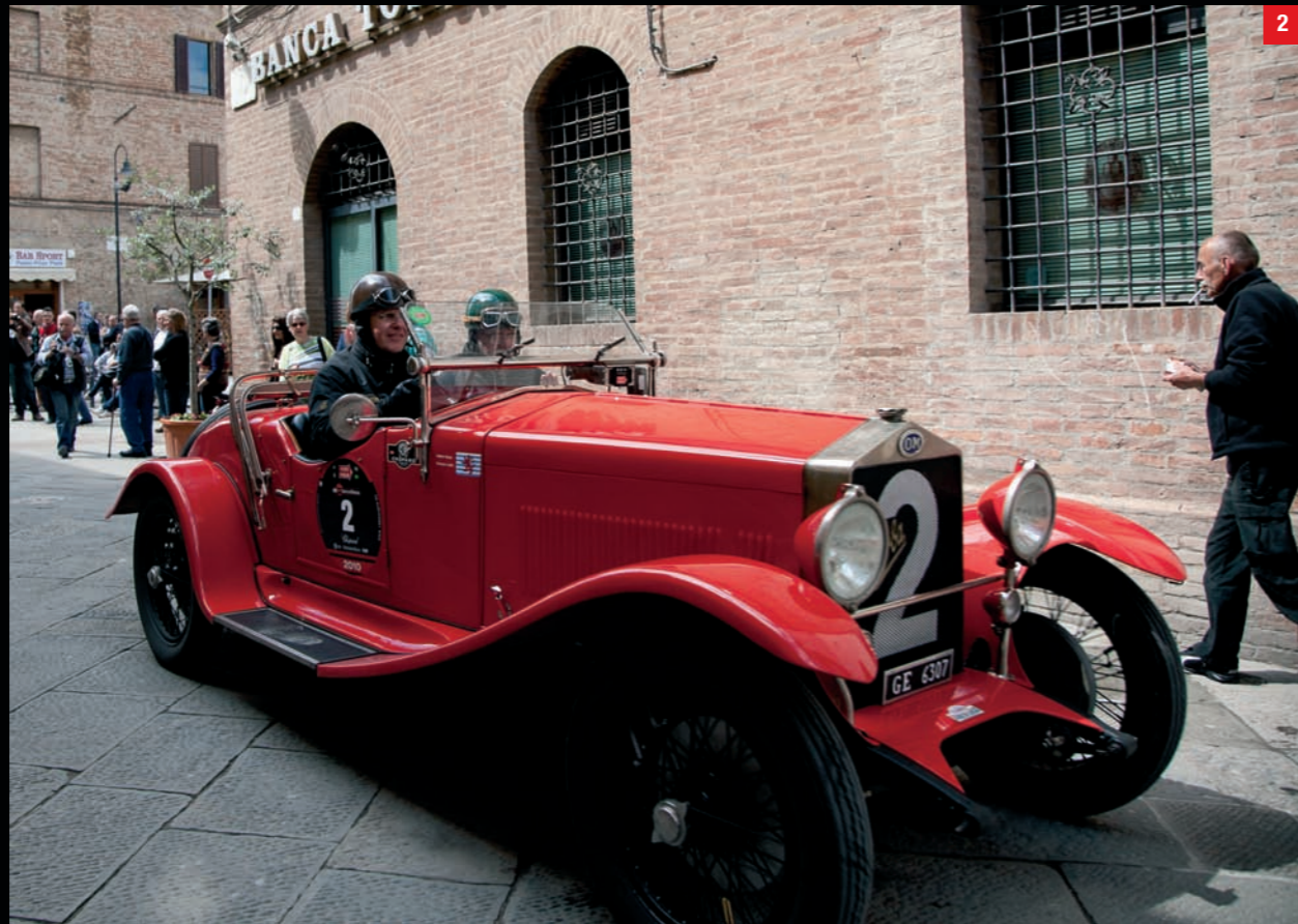
1 Schmitz (D) Roman (D) OM 665 SS (1930) 2 Wetz (L) Collé (L) OM 665 Superba (1927)