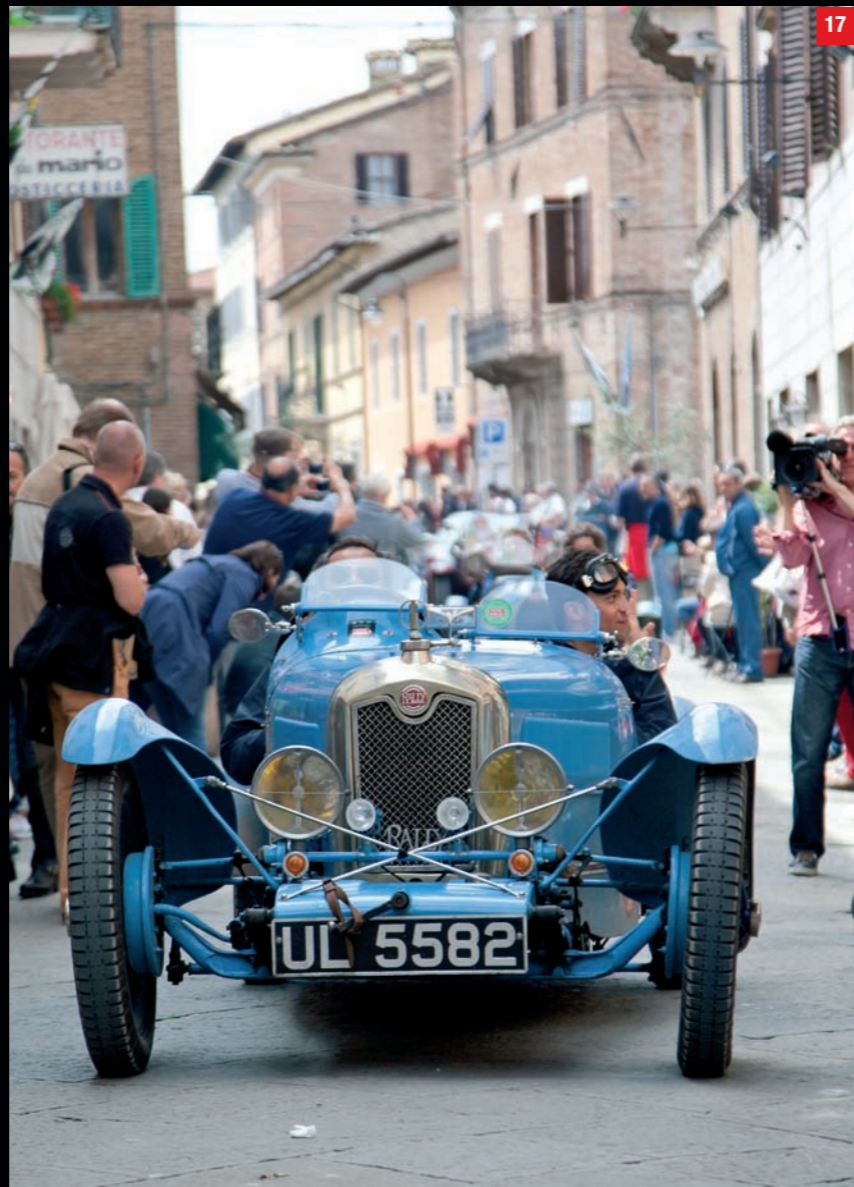
17 Fiorentini (I) Fiorentini (I) RALLY ABC Gran Sport (1929)