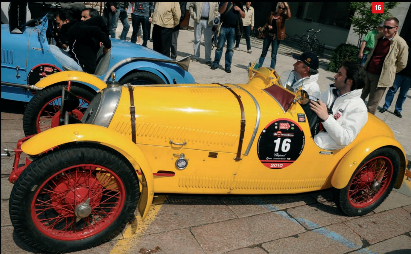
16 Venturelli (I) Venturelli (I) BNC 527 Monza (1927)