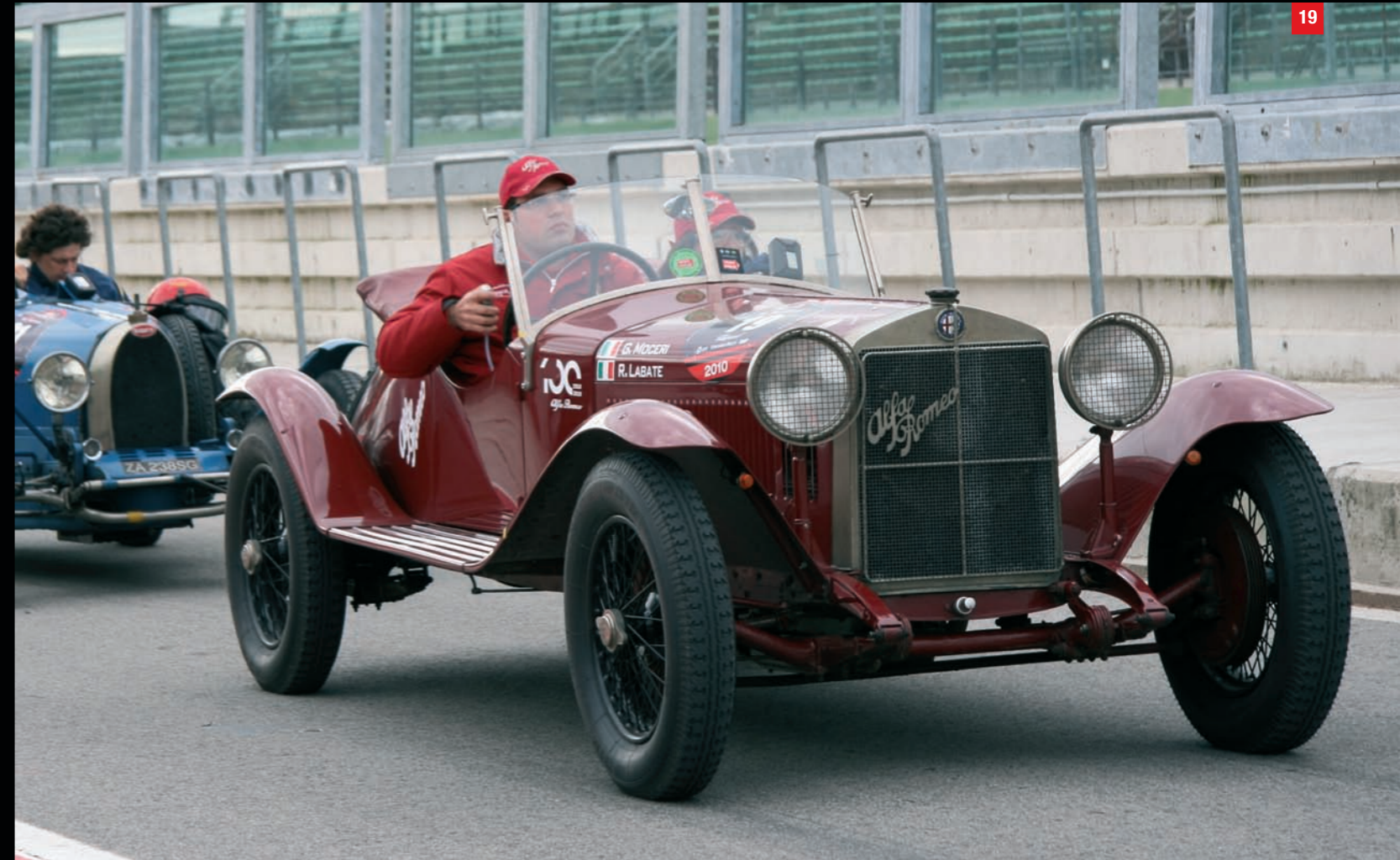
19 Mocerì (I) Labate (I) ALFA ROMEO 6C 1500 Super Sport (1928)