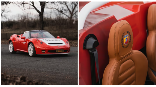
Magazine | Cars