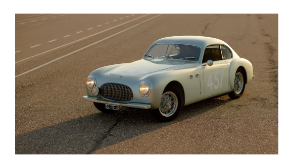
Magazine | Car